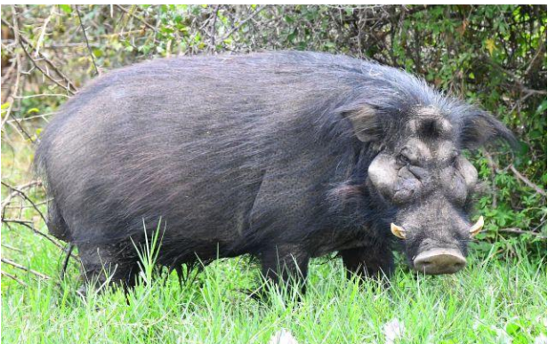
Giant Forest Hog