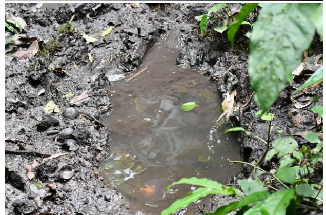
Elephant scat and track