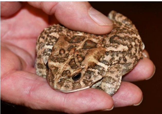
Eastern Flat-backed Toad