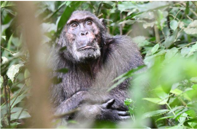
Eastern Chimpanzee (young and old)