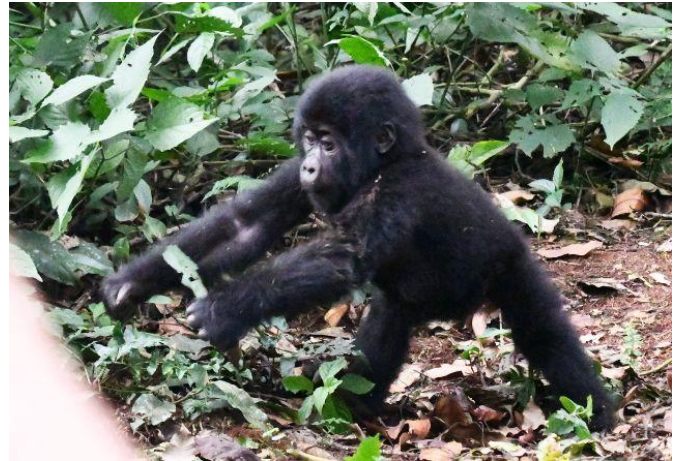
Mountain Gorilla (adolescent and baby)