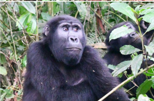
Mountain Gorilla (silverback and female)