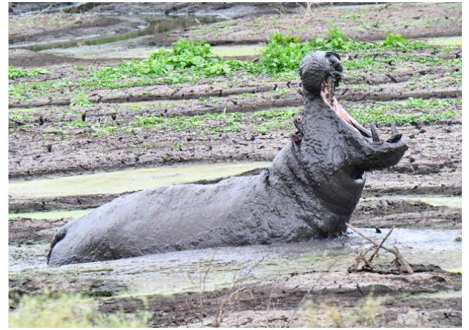
Common Hippopotamus (warding off challengers)