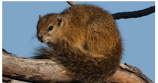
Tree Squirrel