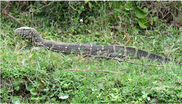
Nile Monitor Lizard