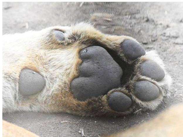
Lion (huge front paw, claws retracted)