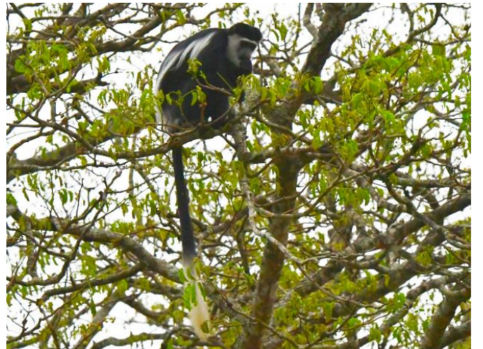
Guerza Black and White Colobus