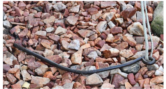
Hippopotamus track and tent stake damage